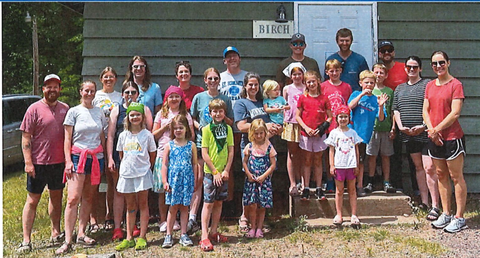
Recognize these folks? They were at Family Camp at Luther Park the last weekend of June!

1509 27th Avenue NE Minneapolis, MN 55418