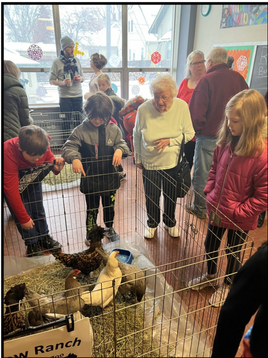
Bible Village Petting Zoo – January 7