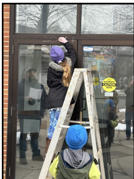
Chalking the Door on Epiphany