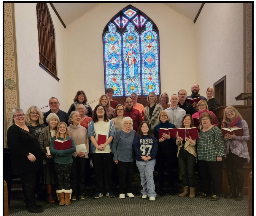
Anniversary Hymn Sing – January 14