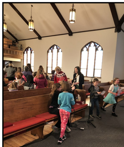
Scavenger Hunt - January 21