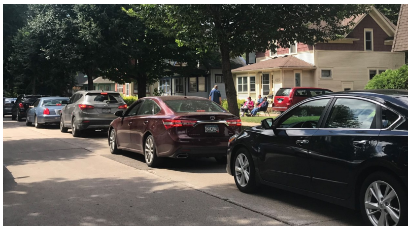
The caravan lined up at the Hendrickses