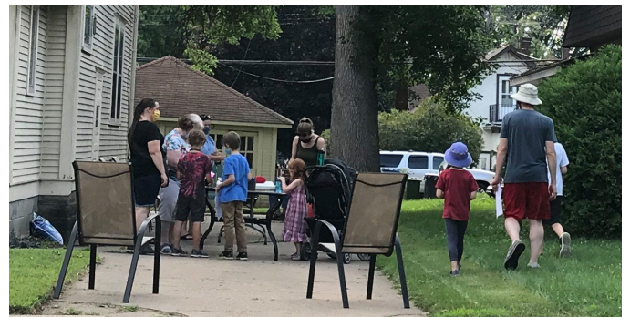
Doing a craft activity at Diana's house