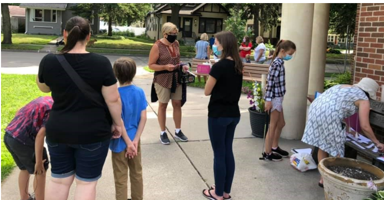
Gathering at the church